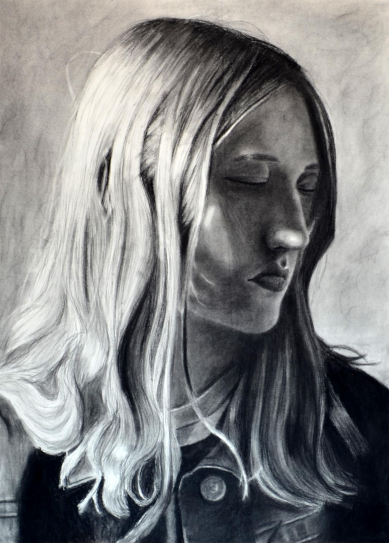
Self Portrait in Chiaroscuro- Drawing 1, Charcoal 16x25in, 2024