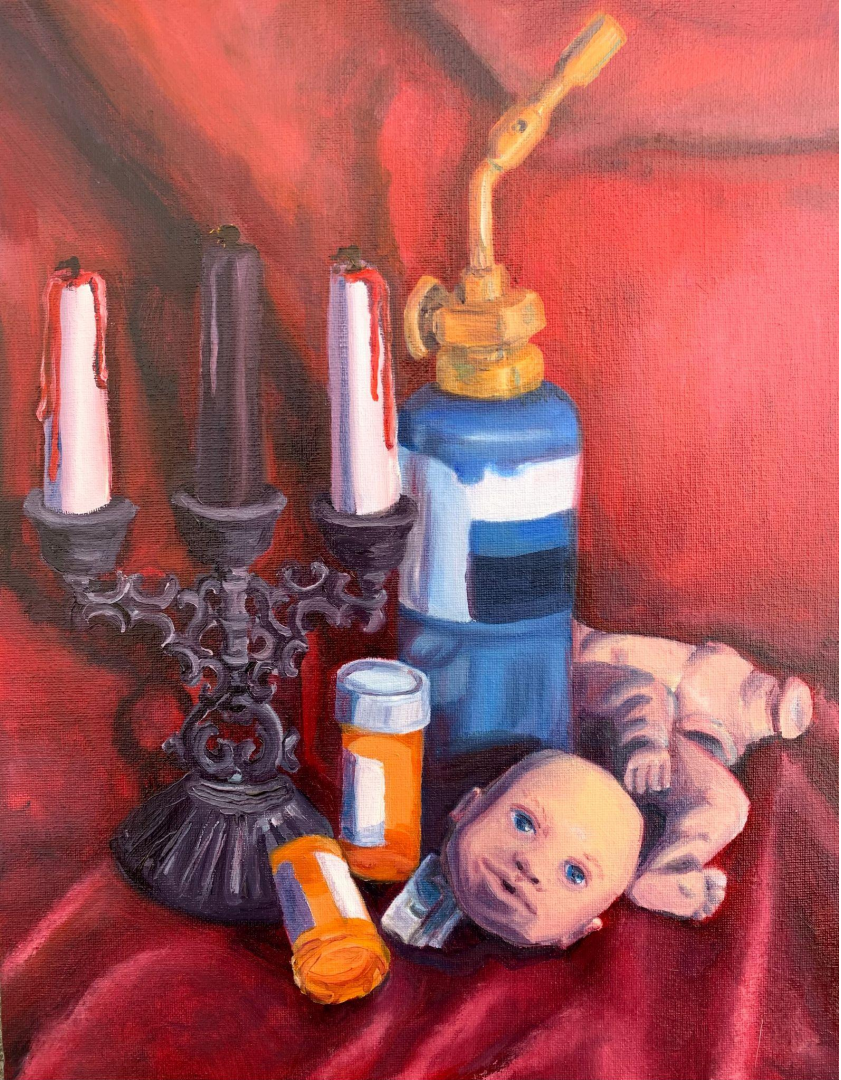
Vanitas Still Life -Painting 1, Oil Paint, 16x20in, 2021