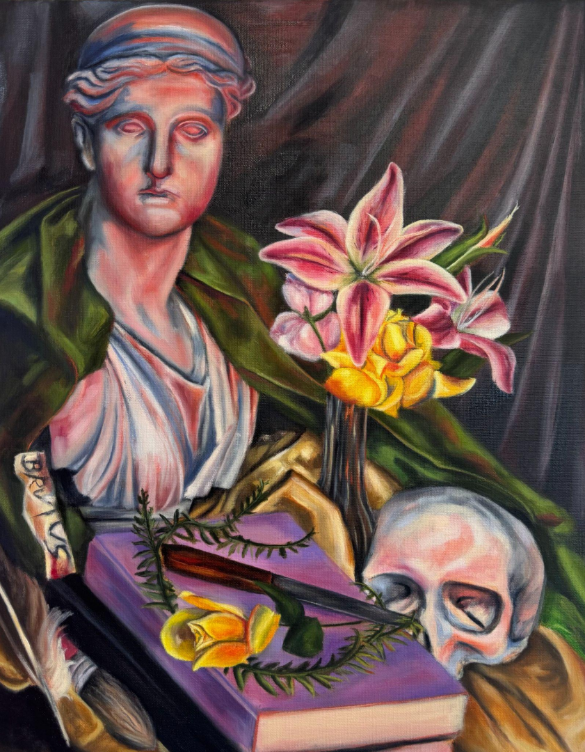
Narrative Still Life -Painting 1, Oil Paint, 16x20in, 2025