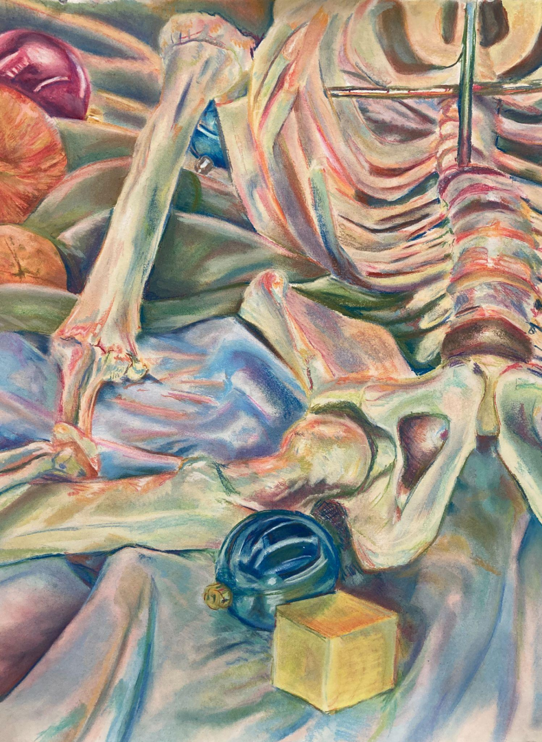
Vanitas Still Life Drawing 2, Pastel, 16x25in, 2022