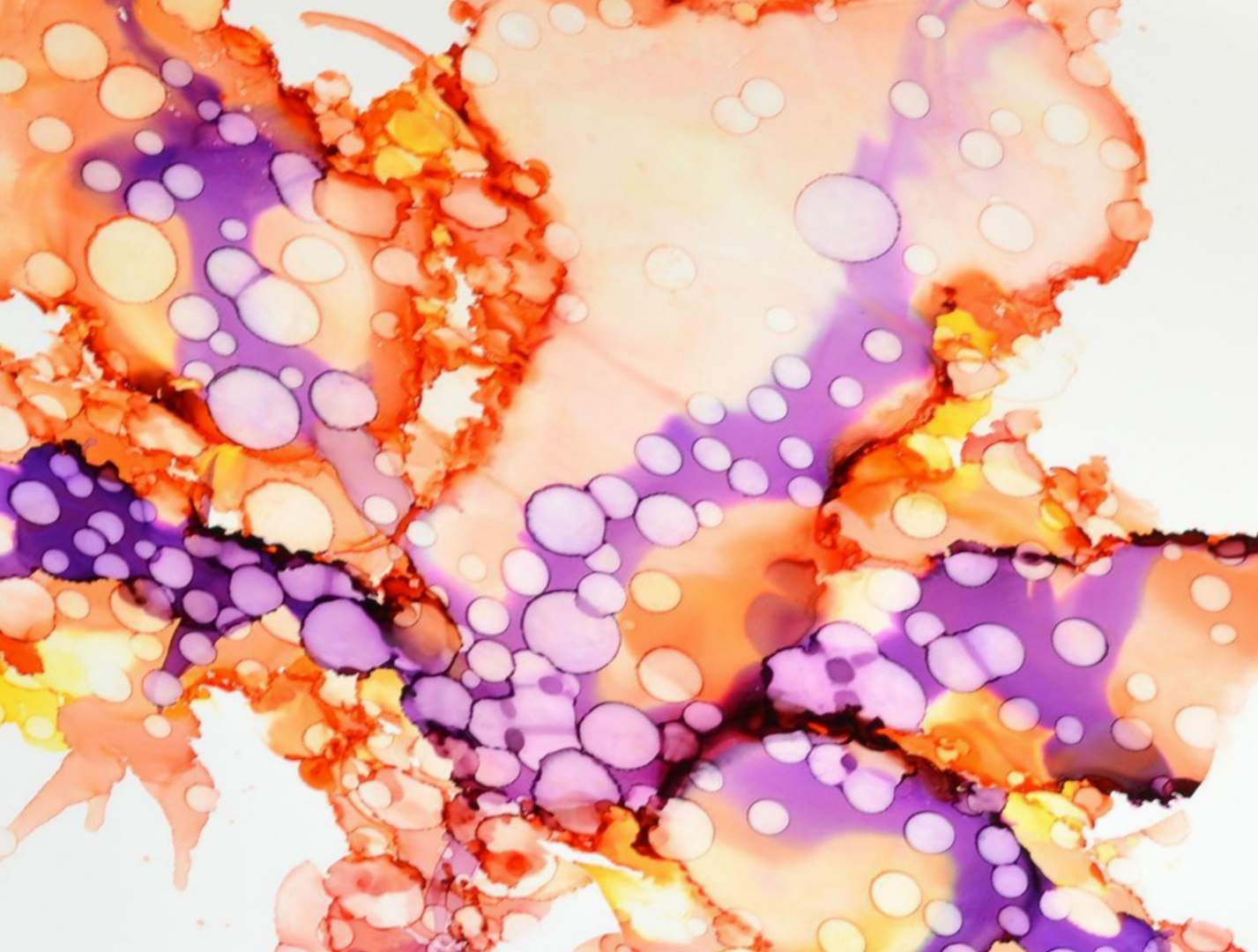
Abstraction from Reference, Topics in Abstraction, Alcohol Ink on Yupo Paper, 20x26in, 2024