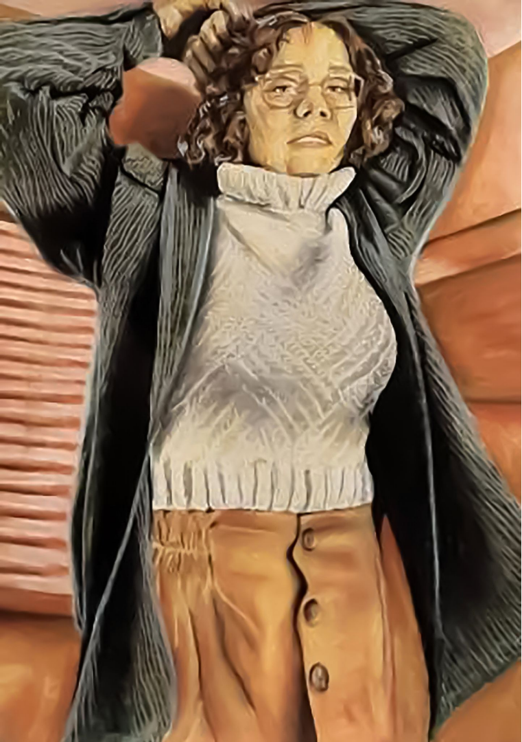
Important Person, Drawing 2, Project, Pastel, 30x22in, 2022