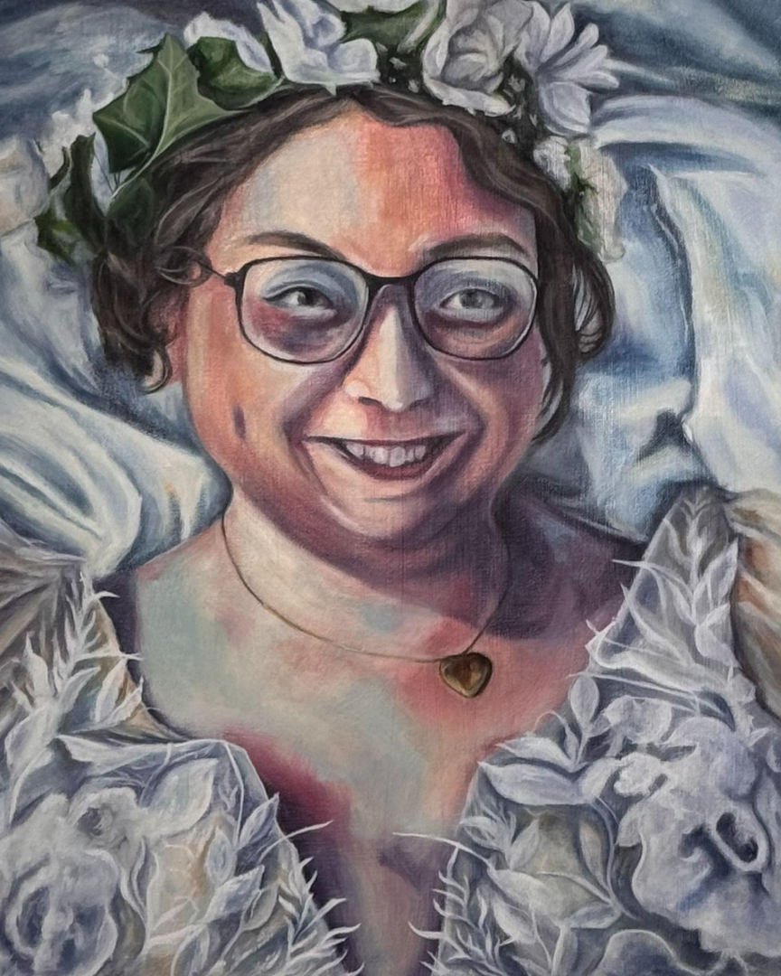
Important Person Portrait Project, Painting Oil on Canvas, 16x20in, 2025