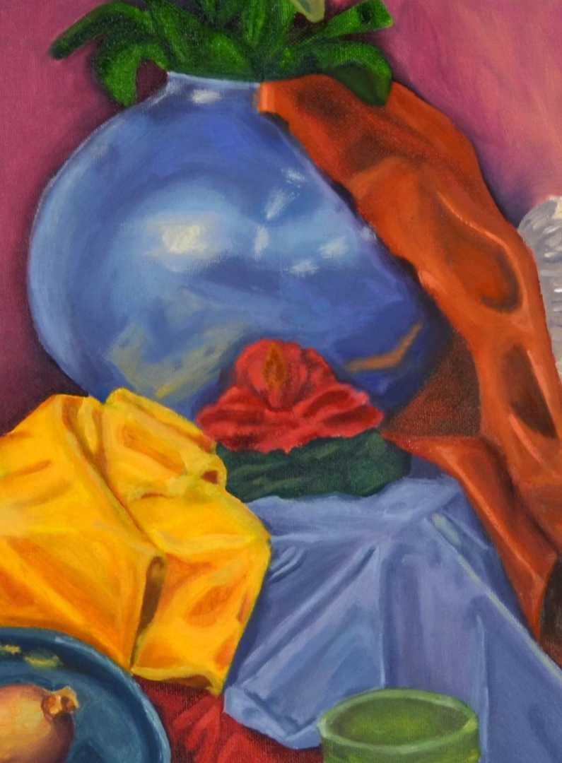
Color and Still Life Study -Painting 1,Oil Paint, 12x9in, 2024