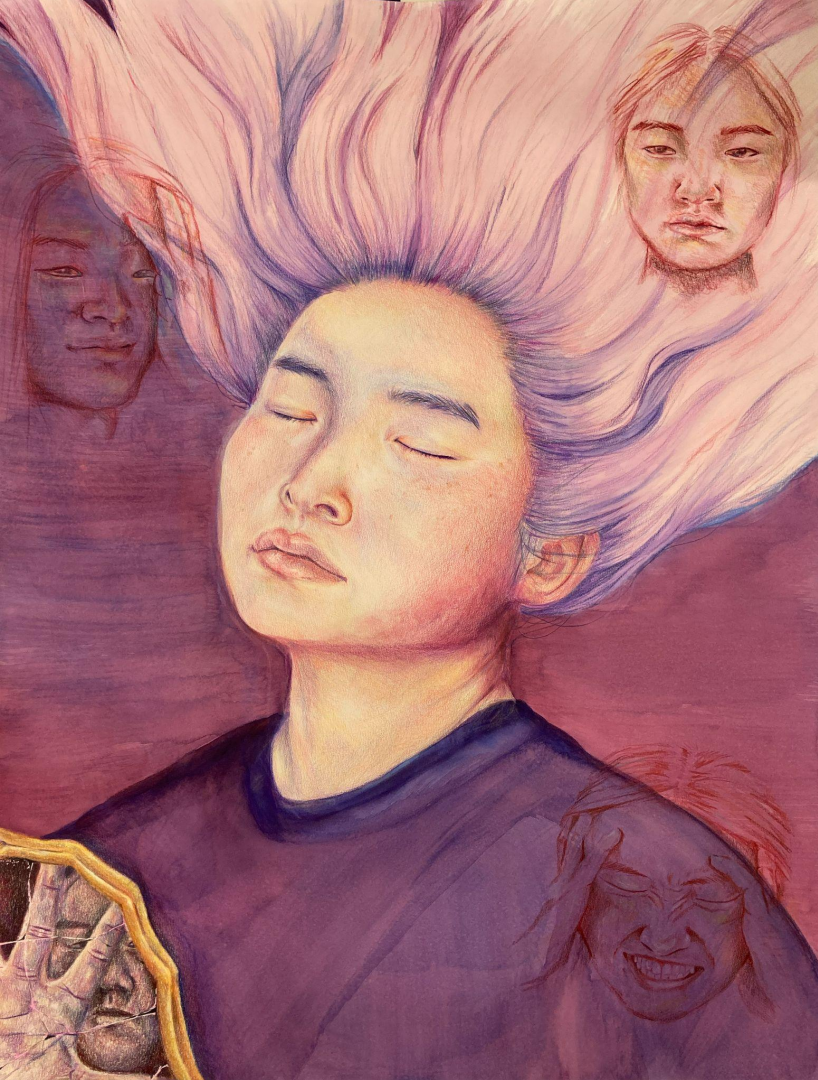
Internal External Self Portrait, Drawing 2, Ink and Colored Pencil. 16x25in, 2025