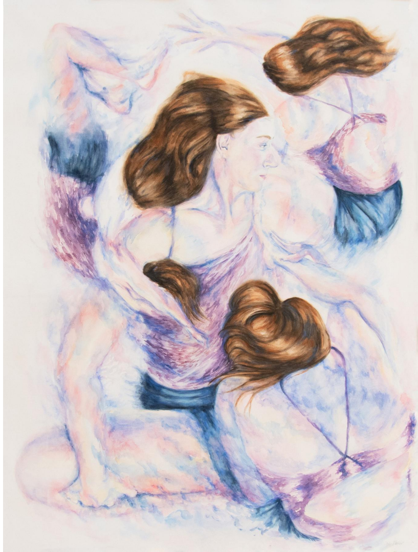
Centripetal, Watercolor, 51x39in, 2023