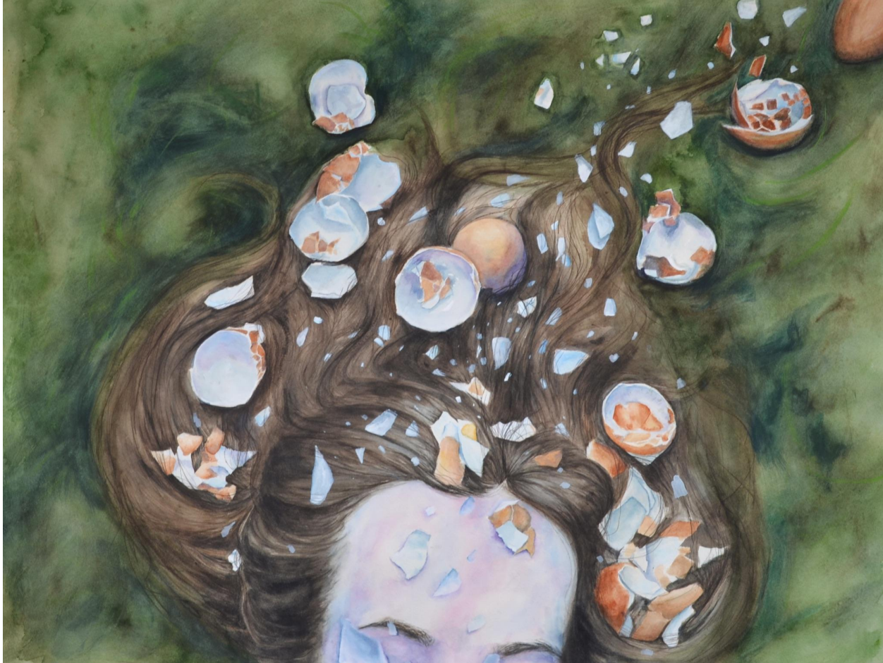
Careful Fragile, Watercolor, 22x30in 2024