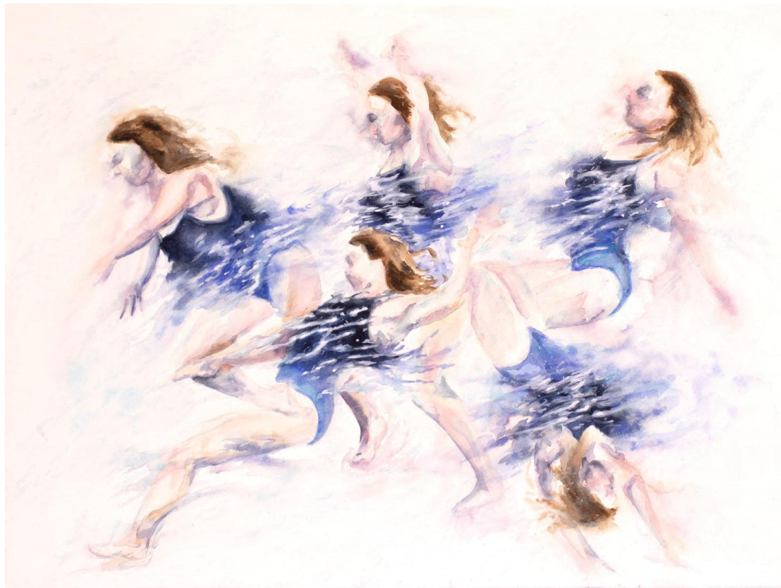
The Divers, Watercolor on Paper 22.5x 30 in 2023