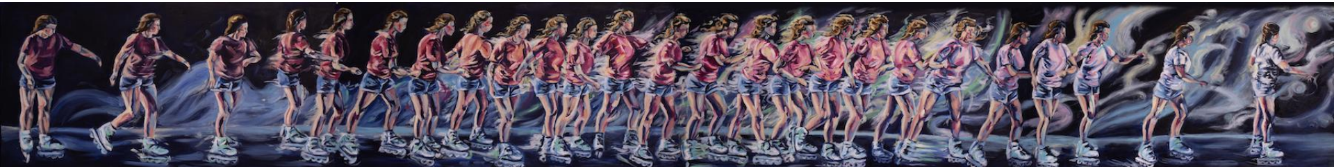
The Skaters, Oil on Canvas, 24inx192in, 2023 Individual Panel Link:

https://www.katiepetersenart.com/oil-paintings?lightbox=dataItem-lfbl14dc