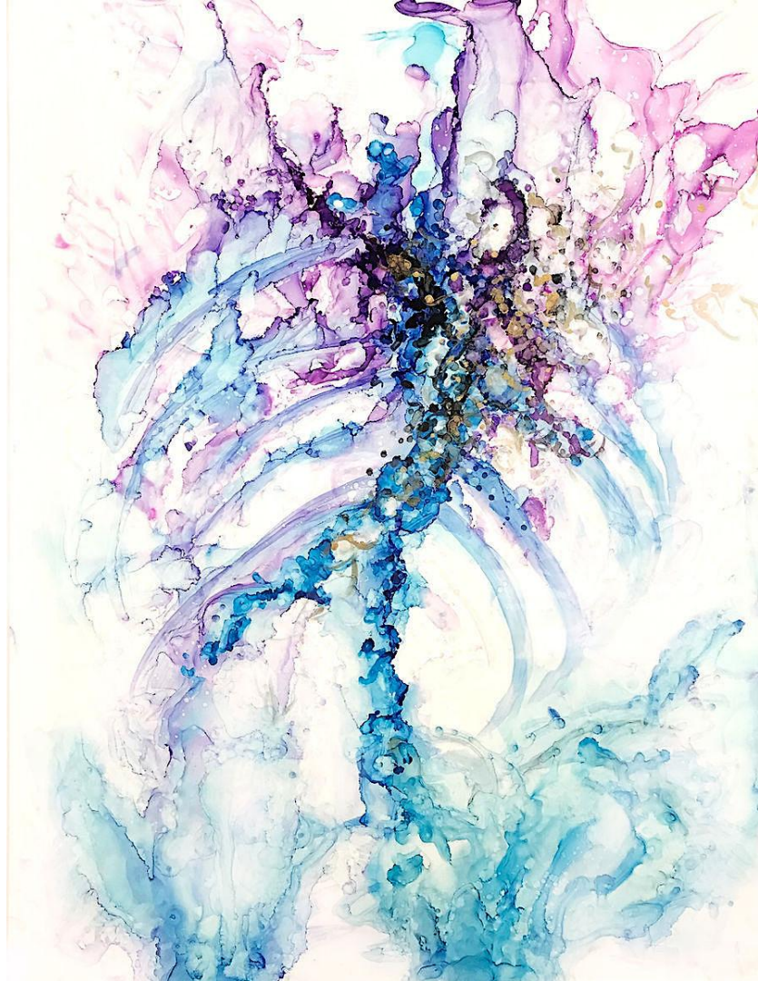
Nerves, Muscles, and Bones, Alcohol Ink on Yupo Paper 26x20in, 2022