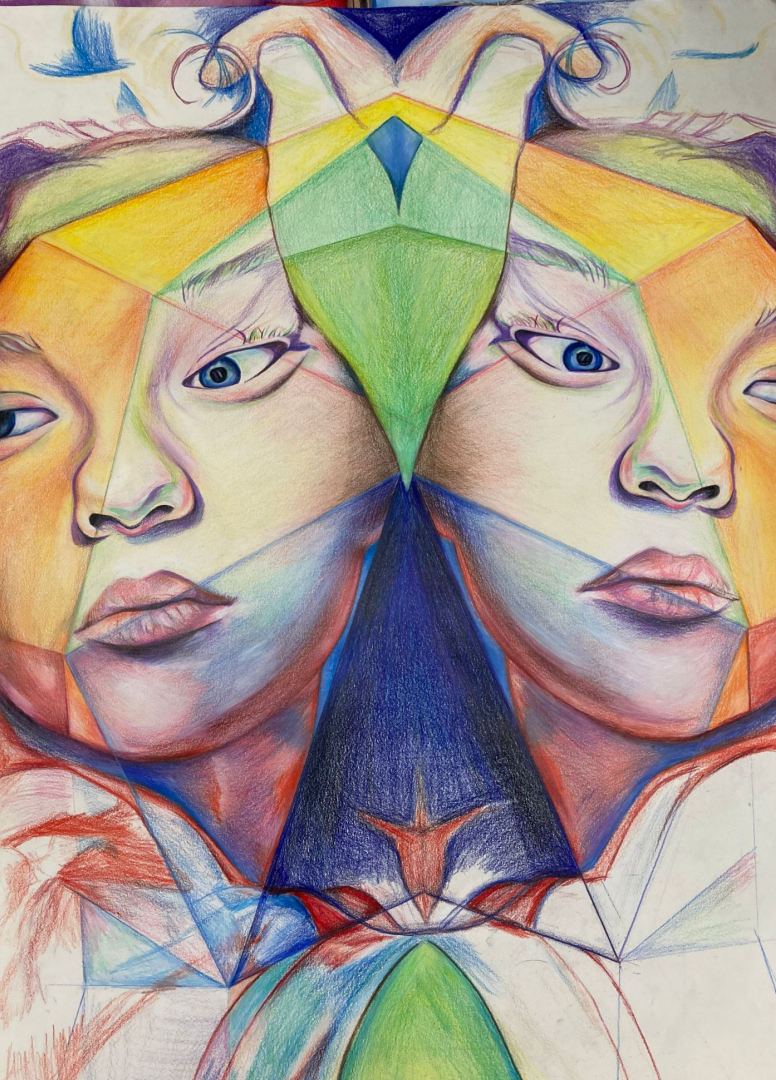
Internal External Self Portrait, Drawing 2, Ink and Colored Pencil. 16x25in, 2024