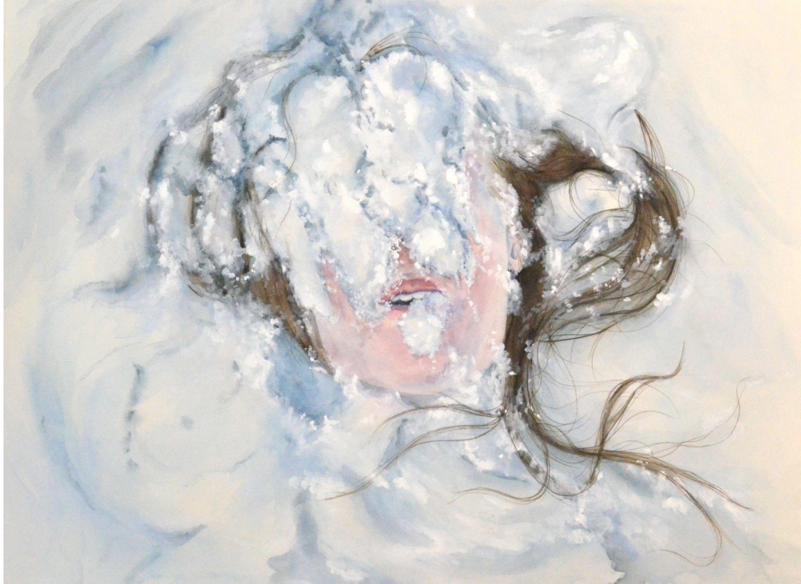
In Search of Perfection Triptych Part 3, Watercolor, 22.5x 90 in 2024