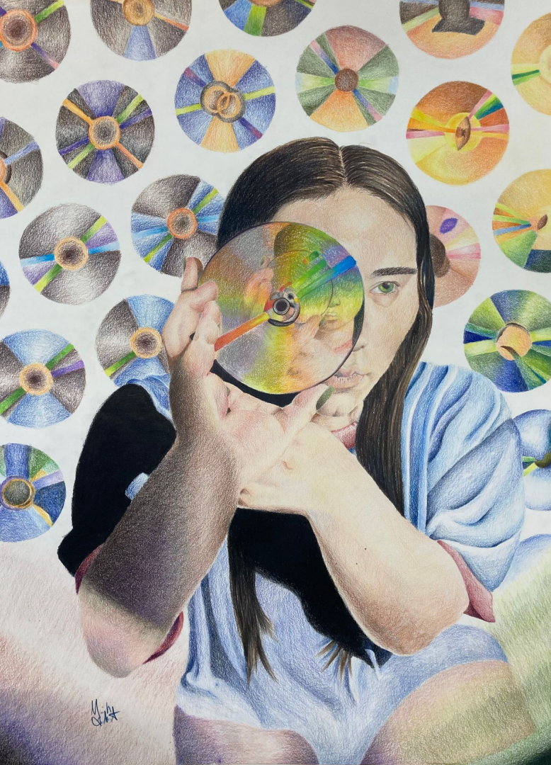
Internal External Self Portrait, Drawing 2, Ink and Colored Pencil. 16x25in, 2024