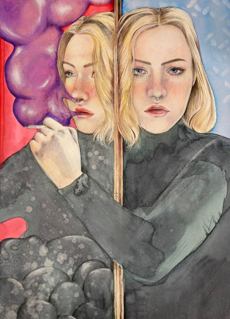
Internal External Self Portrait, Drawing 2, Ink and Colored Pencil. 16x25in, 2024