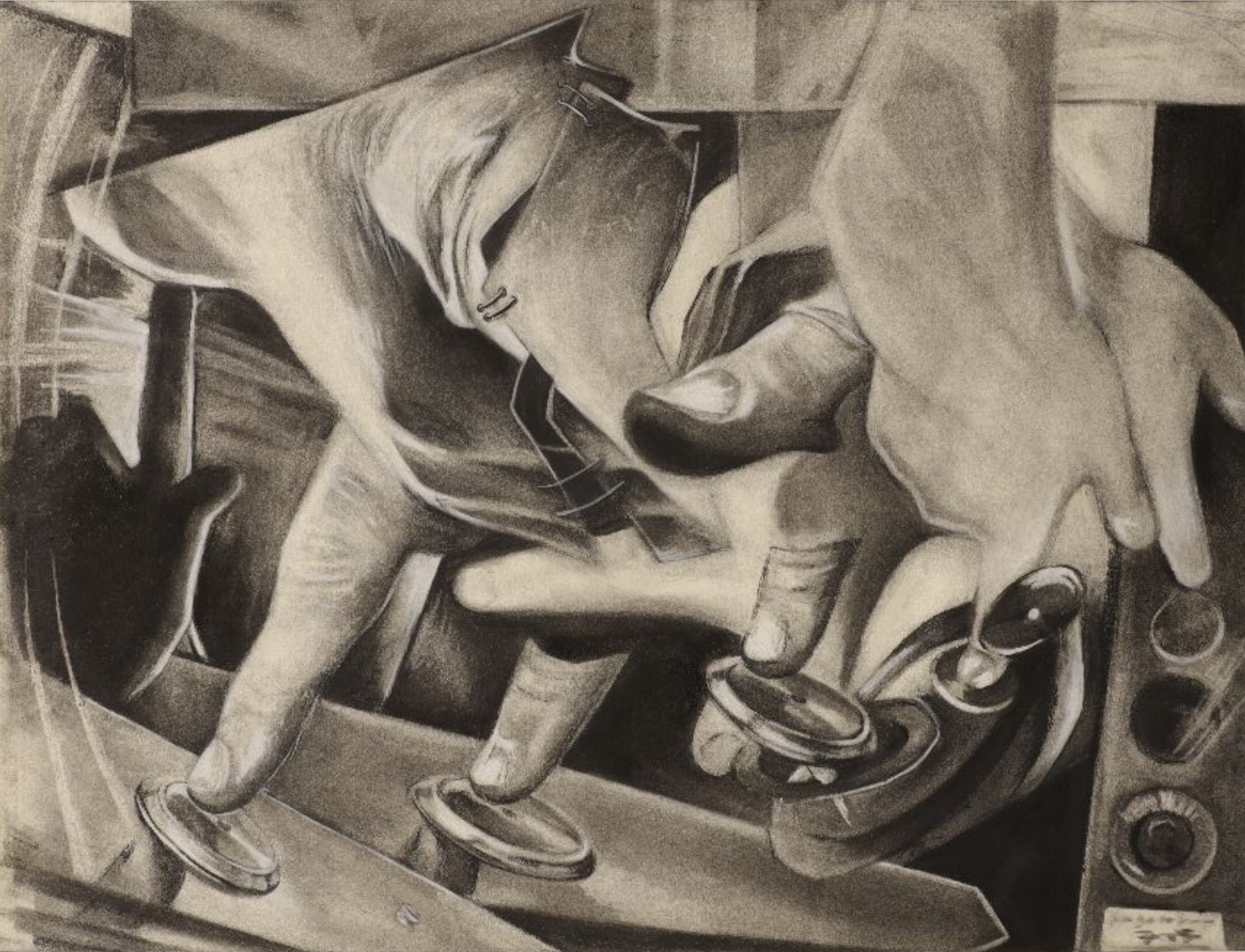
Cubism and Collage, Drawing 2, Charcoal, 16x25in, 2024