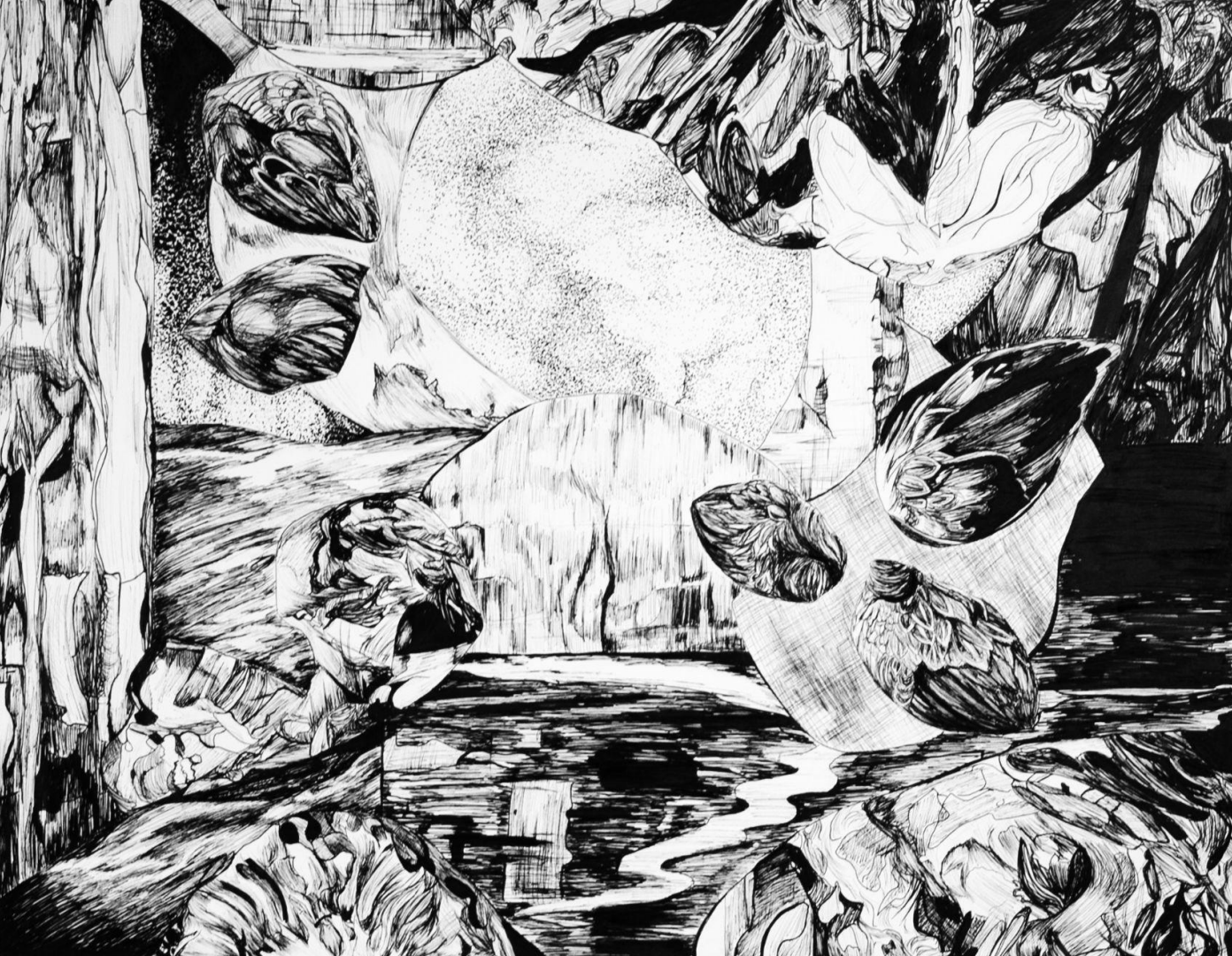
Texture and Composition Collage - 2D- Design, Ink, 19x24in, 2024