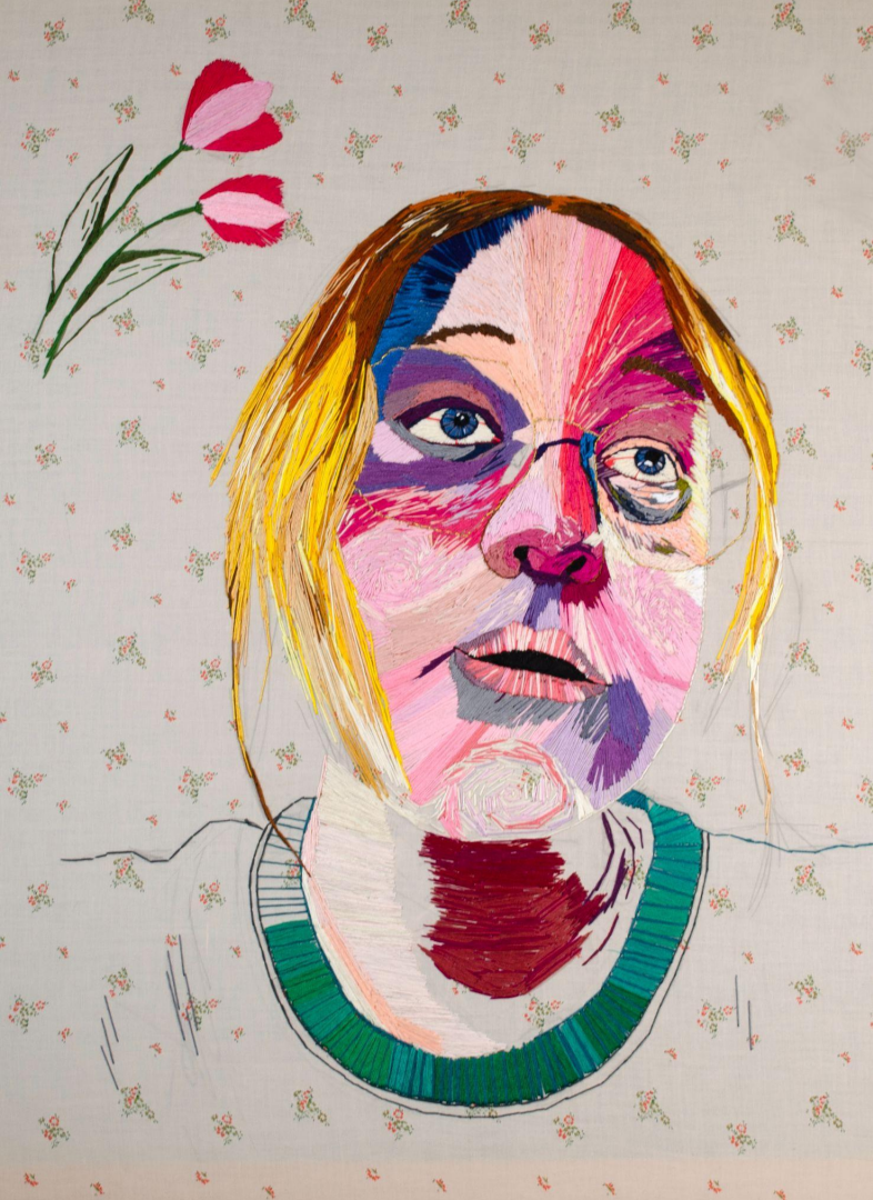
Personal Symbol- Advanced Studio, Textile Embroidery,, 40x30in, 2024