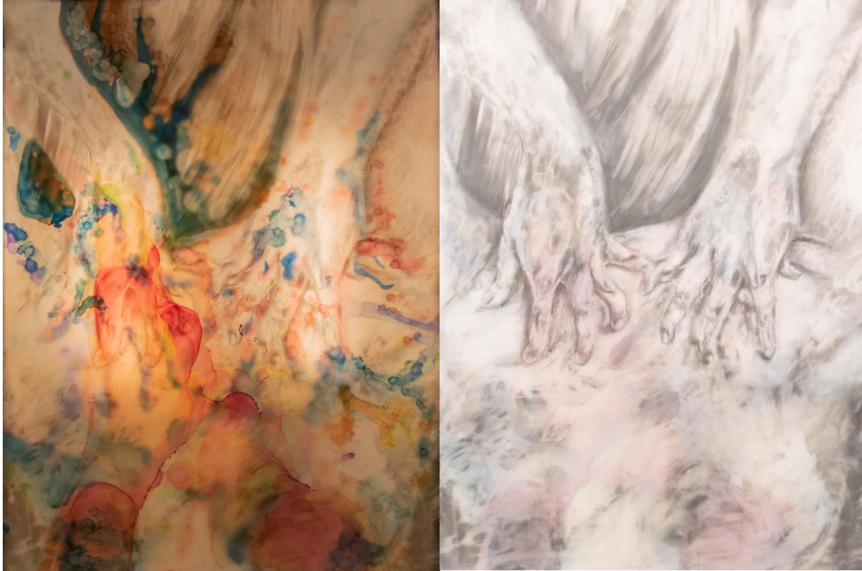
Pain Lit and Unlit,