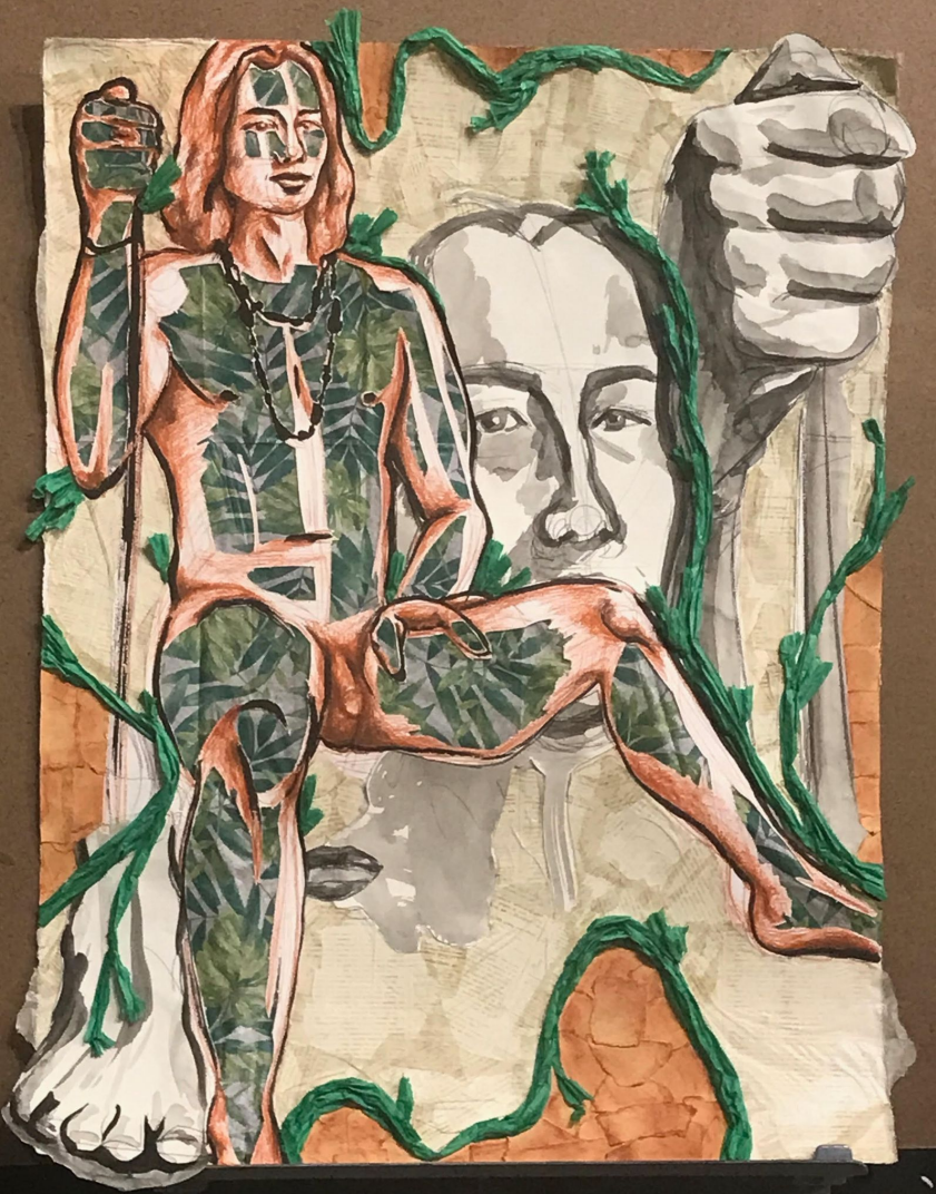
Figure and Narrative, Figure Drawing, Sophomore, Conte Crayon & Paper Collage, 22x30in, 2021