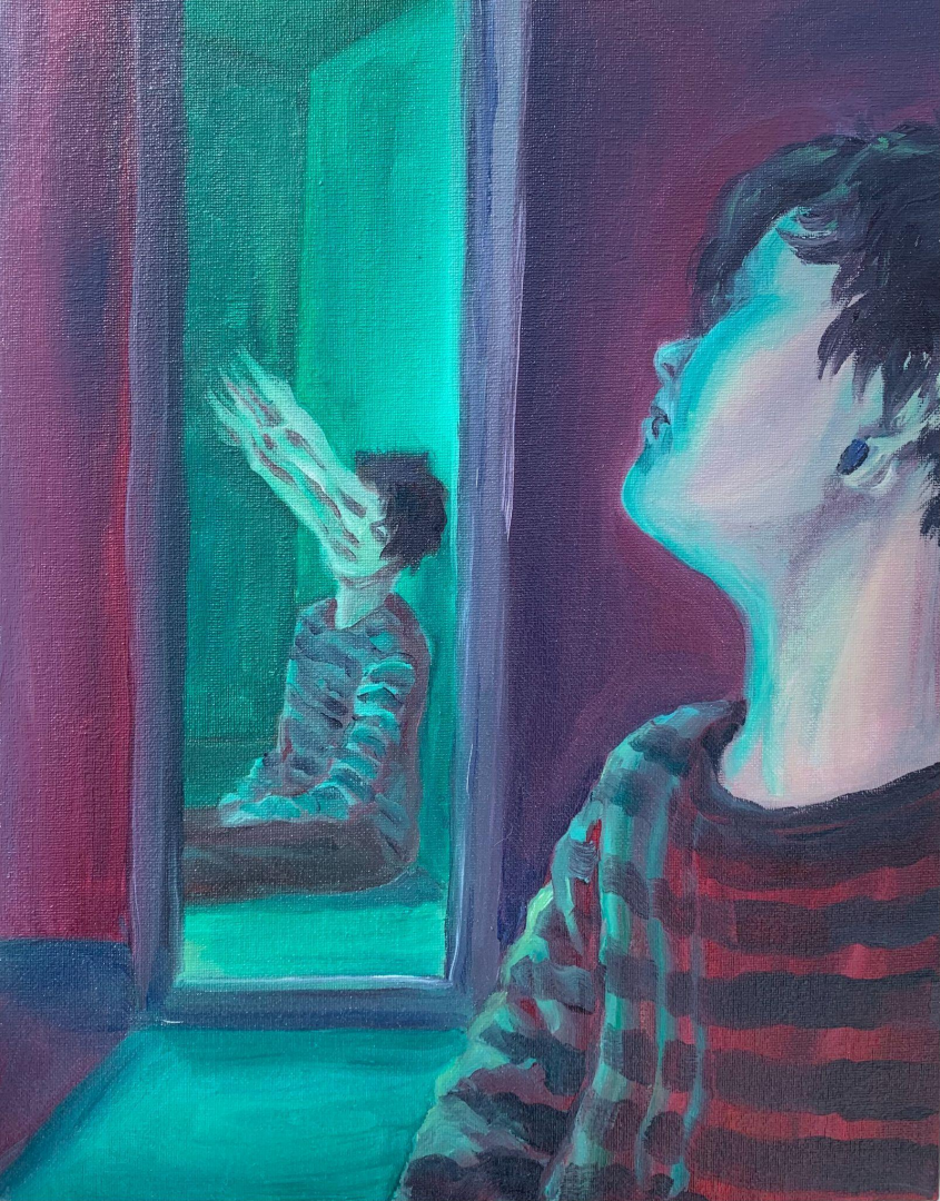
Self Portrait-Painting 1, Oil Paint, 18x24in, 2021