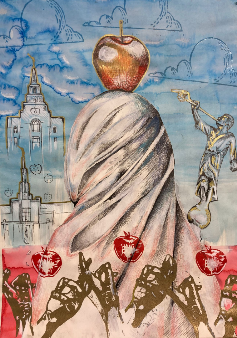
Utopia vs Dystopia, Ink, Colored Pencil & Printmaking, 30x22, 2024